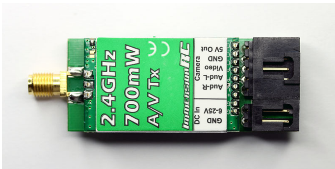
Fig 1. Top side of ImmersionRC 700mW 2.4GHz audio/video transmitter.

The ImmersionRC 700mW 2.4GHz audio/video transmitter requires a suitable antenna (included) and a supply voltage to be connected to be functional. Please refer to the below noted images for familiarizing yourself with your audio/video transmitter prior to connecting the audio/video transmitter to your power supply and camera or audio/video source.